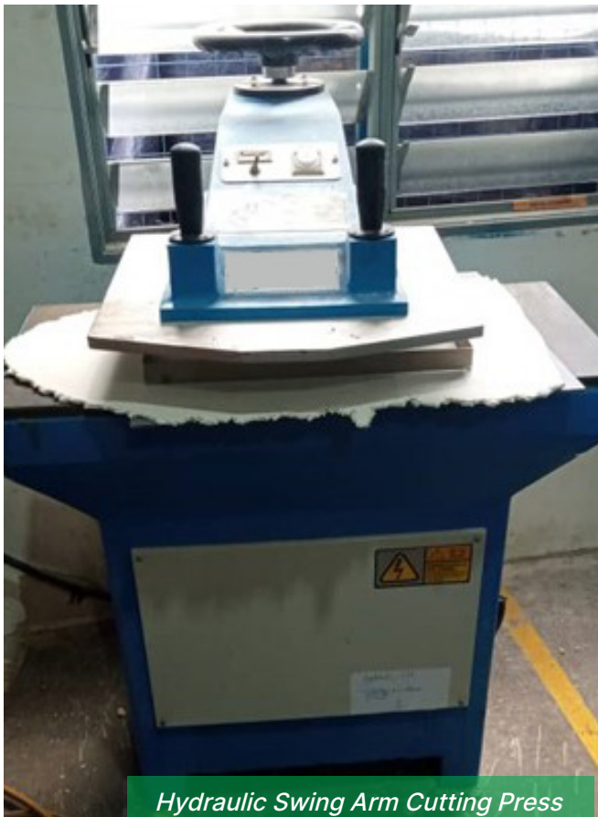
Hydraulic Swing Arm Cutting Press

estimated annual savings on manpower costs