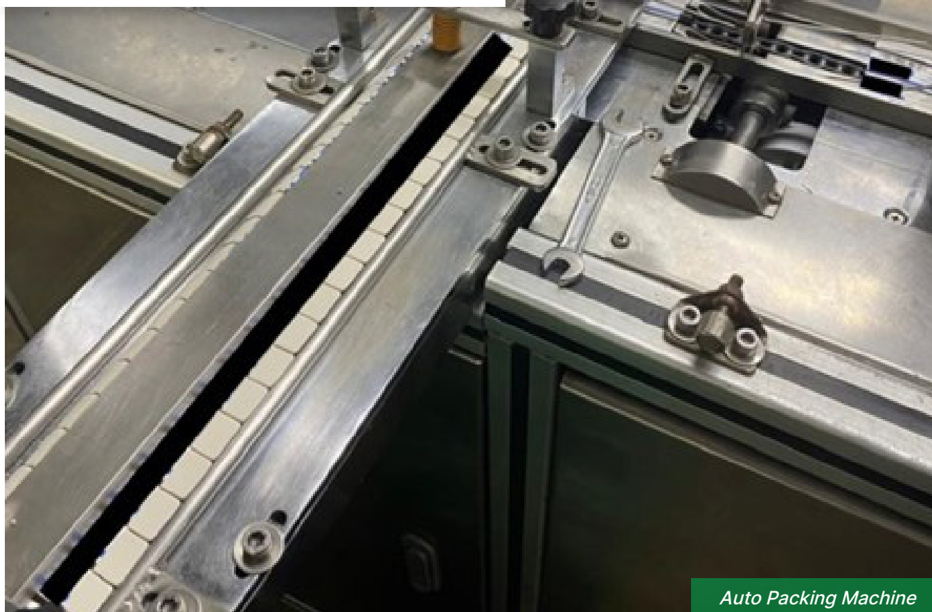
Auto Packing Machine

Through the FAGT initiative, Fudex Rubber Products (M) Sdn Bhd has implemented advanced and automated machinery in its manufacturing and packing processes. The company invested in a Hydraulic Swing Arm Cutting Press, revolutionising the eraser cutting process.